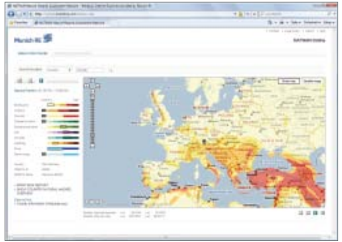
Increasing transparency with only a few steps: NATHAN Single Risk Online.